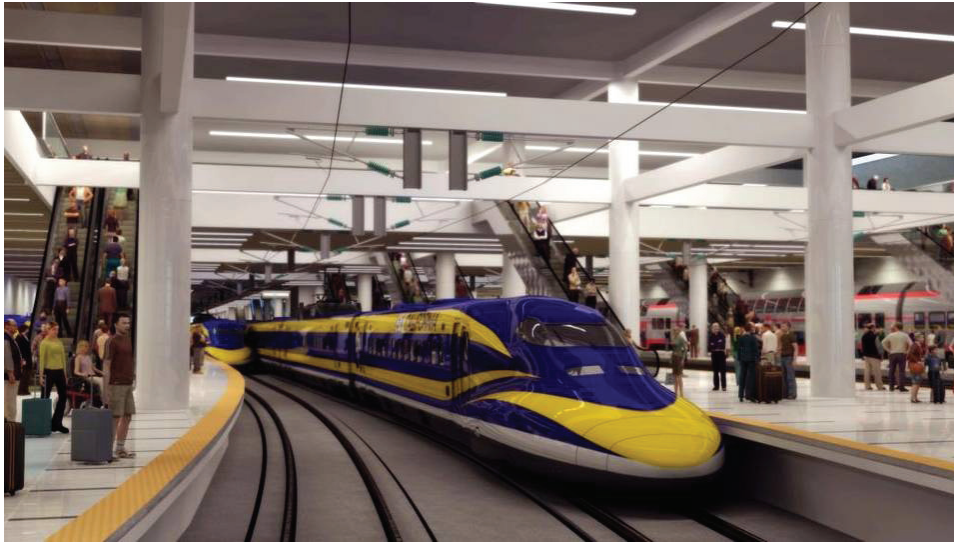
An artist's rendering depicts a California high-speed train pulling into a station. California High-Speed Rail Authority (Special to The Bee)